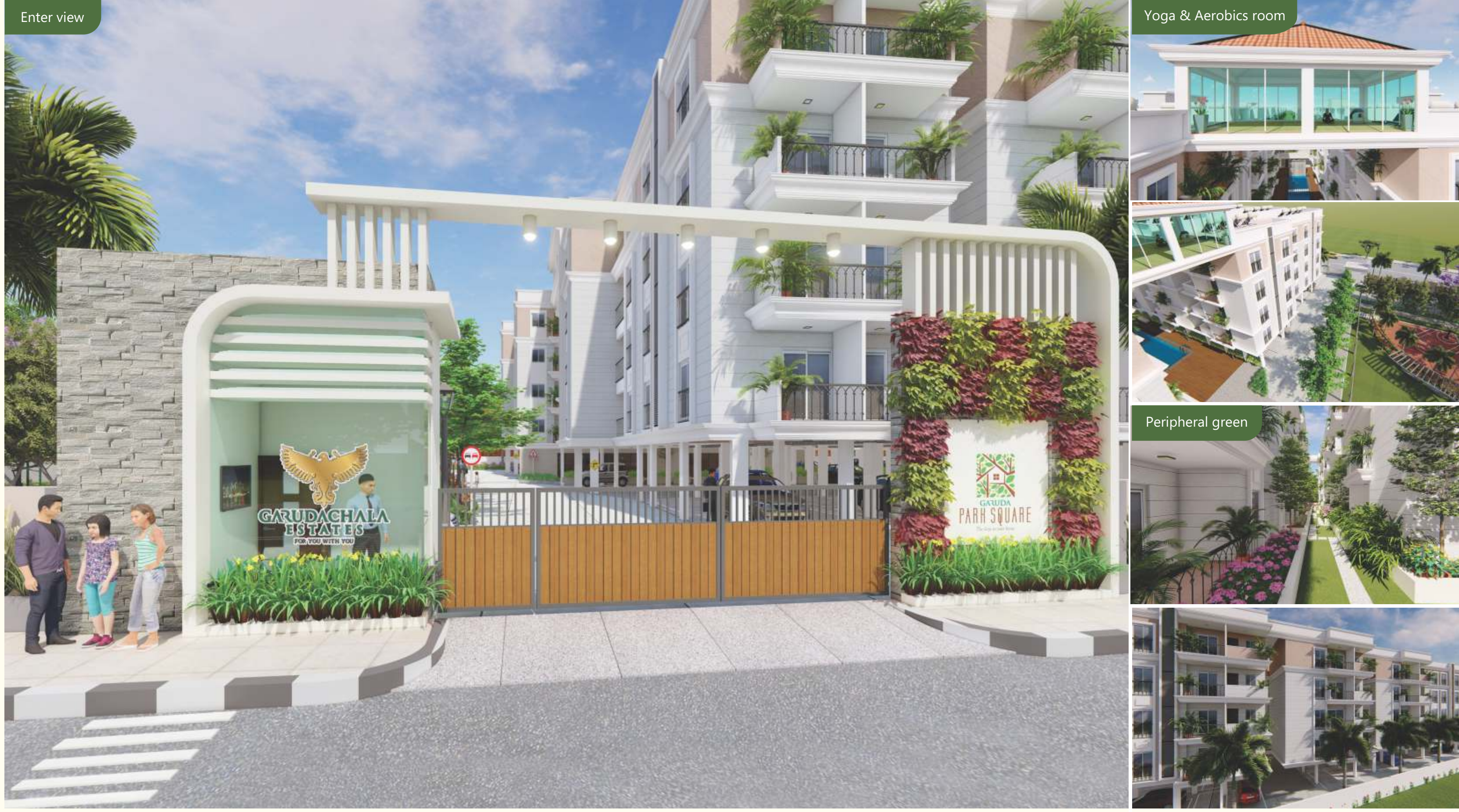
This is an artist's impression only and not the actual image.