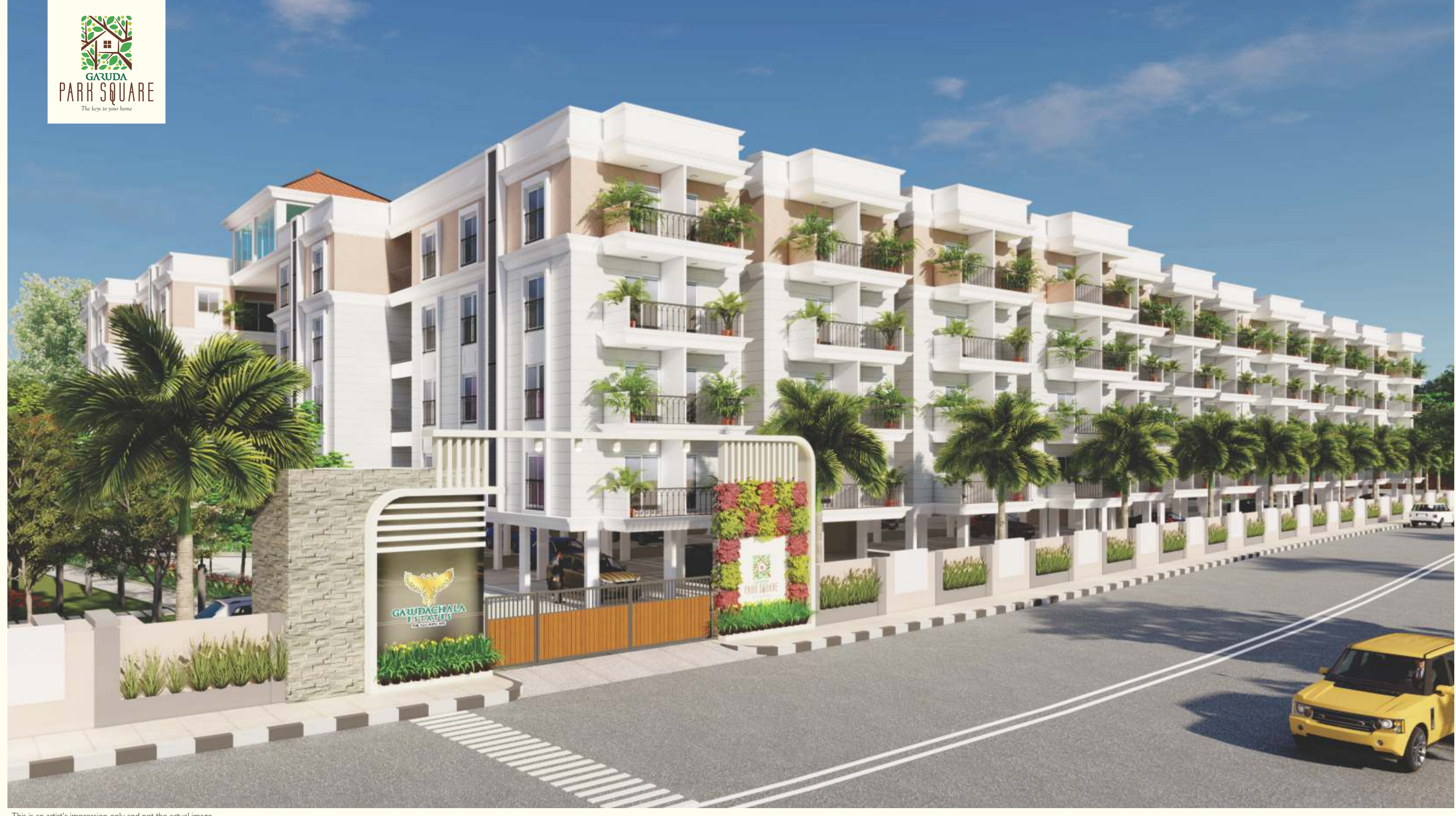
This is an artist's impression only and not the actual image.